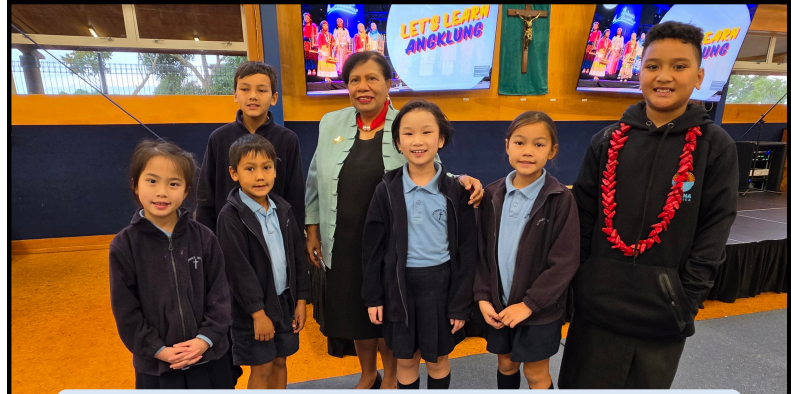
Children of Indonesian descent with The Indonesian Ambassador to New Zealand, Mrs Suebu.