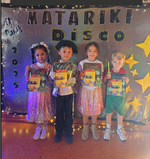
Best Dancer and Best Costume Winners Junior Disco