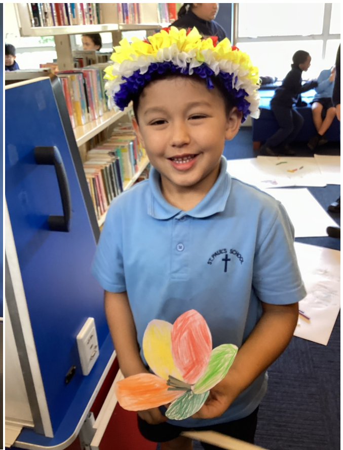
Kiribati Day Leaders